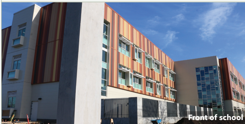
Front of school

Designed through an extensive public engagement process, the Kellogg site includes over 100,000 sq. ft. of new construction, including a performing arts stage, a multi-purpose gym and assembly space, a large, flexible commons space, and dedicated outdoor learning spaces. The school will become a focal point of its Southeast Portland neighborhood, offering a resource hub for the community.