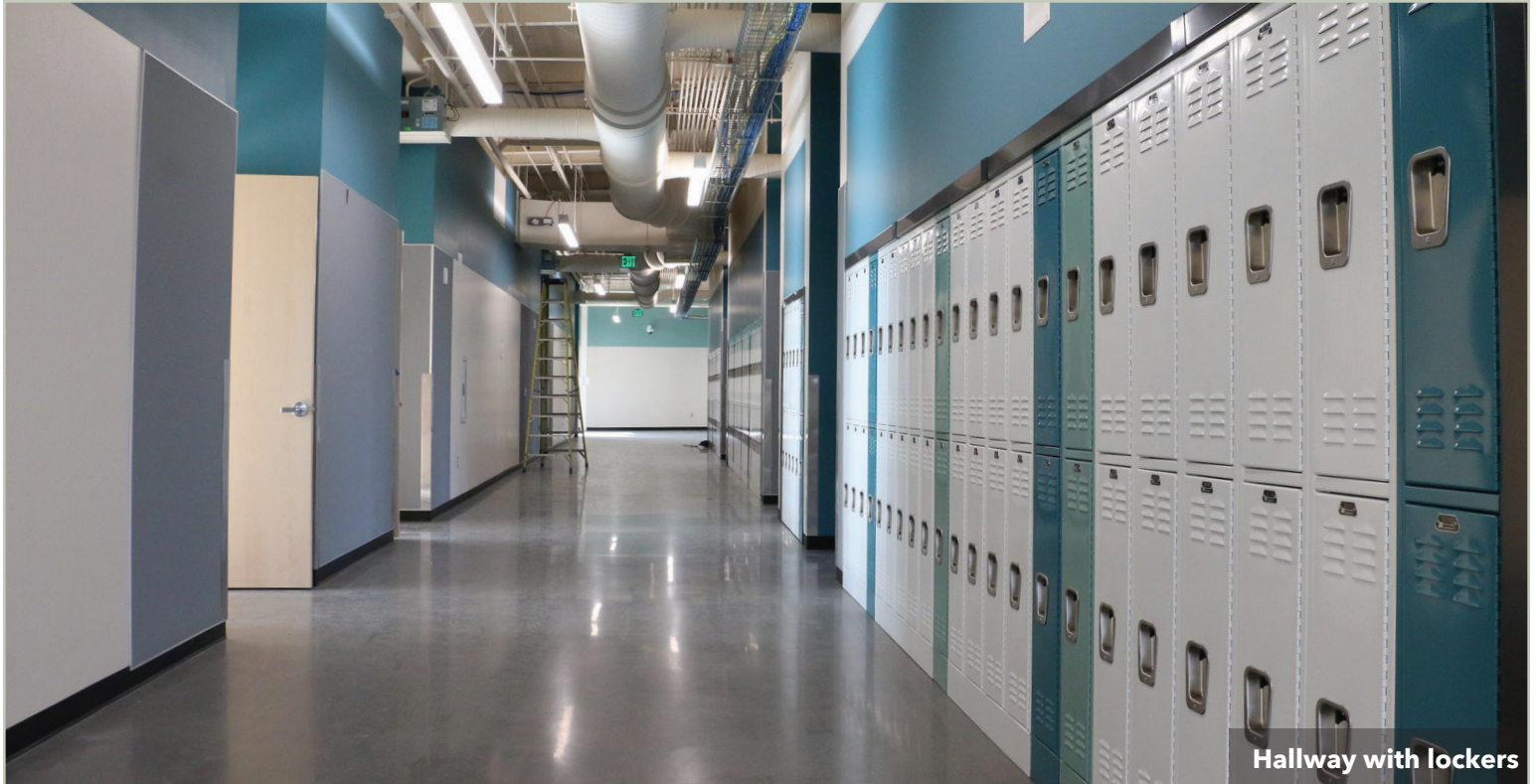
Hallway with lockers