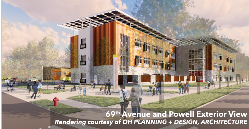
69 th Avenue and Powell Exterior View Rendering courtesy of OH PLANNING + DESIGN, ARCHITECTURE